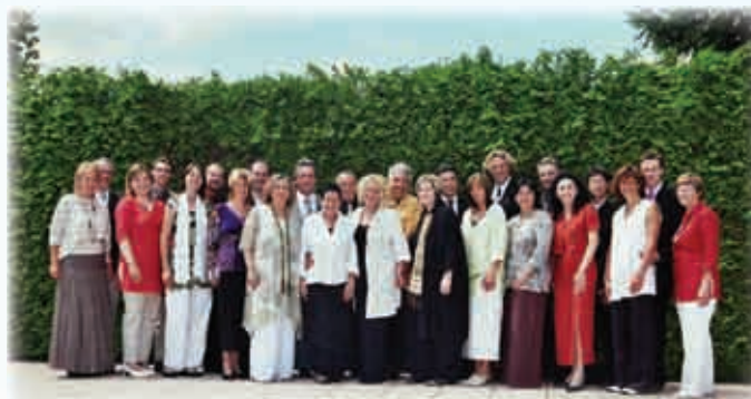
The team of His Place welcomes you.